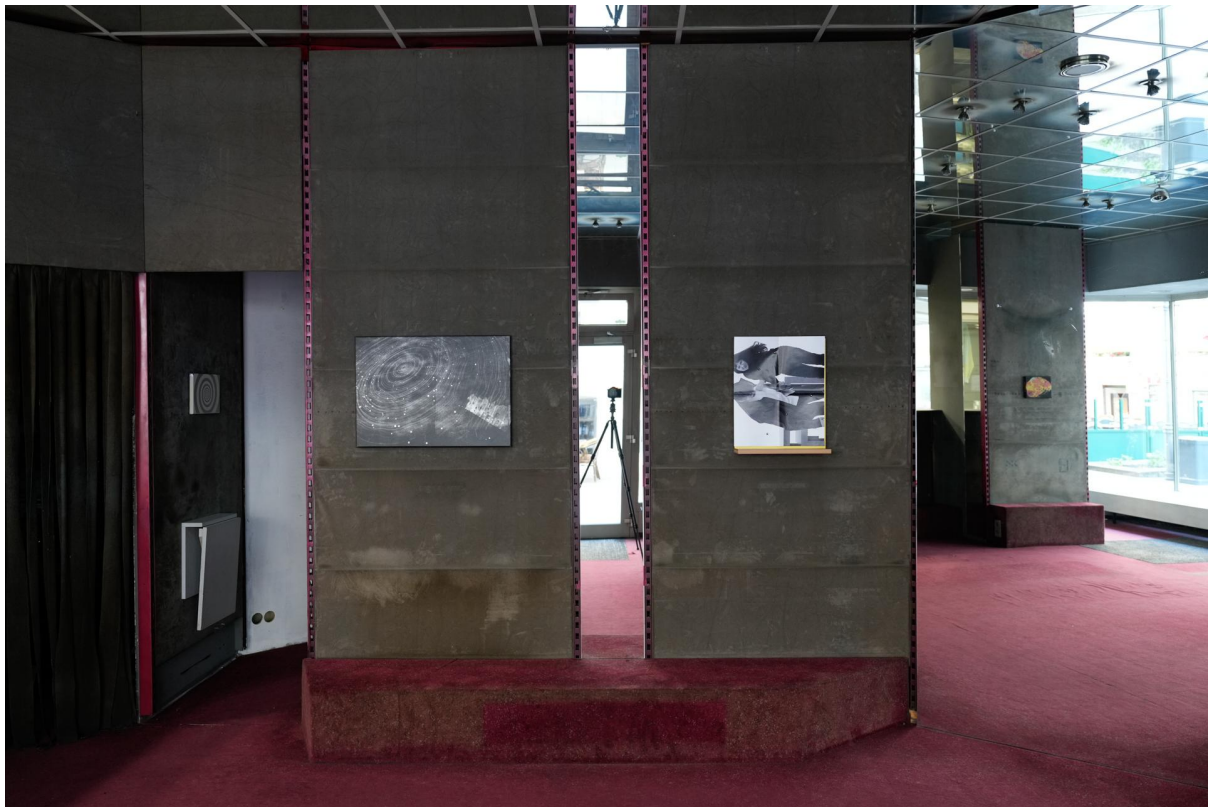
Borgenheim Rosenhoff is an artist run space in Oslo, founded in 2022.